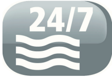
Permanent water drainage tube