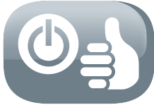
Easy to operate